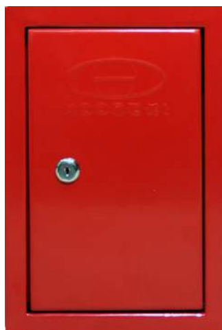
BOX TB 12 pairs