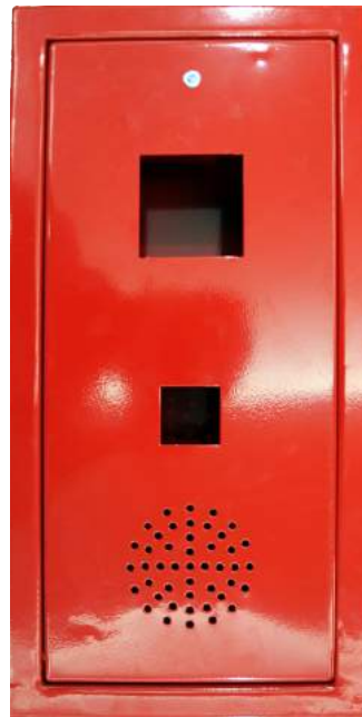
HS-PBL Fire Alarm Combination