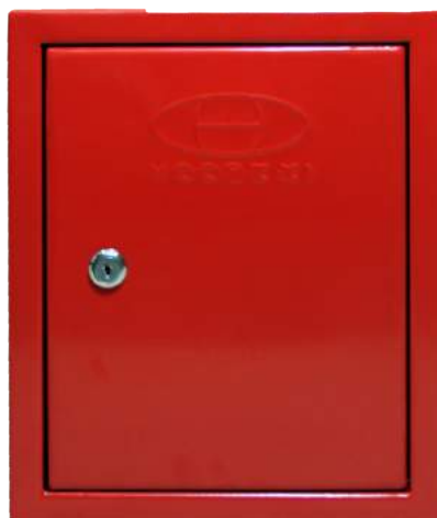
BOX TB 24 pairs